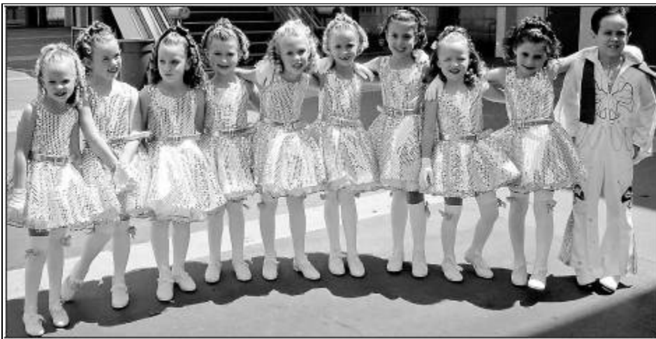
WINNING EFFORT: Junior Dance Co. cuties' "Elvis" dance got top prize at the "On Stage America" dance competition held in Long Beach.